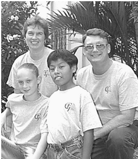
NEW FACE OF HOMELESSNESS?

February's homelessness report indicated that the four Smiths -- parents