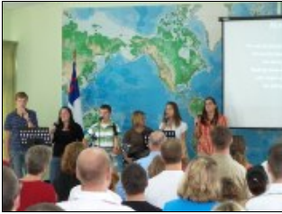
Chapel at ILE

How I wish that were an easy thing to do, to always be at His feet. I find at times that I'm so engrossed in what I'm doing that it has been days since I sat at His feet and soaked in what He is trying to tell me.