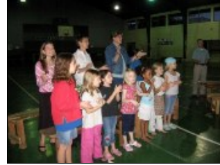
Bible School for children of ILE students during Spiritual Emphasis Week

My time in Costa Rica has been an emotional, spiritual, and physical roller coaster ride. Sometimes the track is up and then down, but other times, like a month ago, it is doing loop to loops. Those who know me well know that I don't do roller coasters. Since being in Costa Rica the enemy has tried all kinds of ways to get me to give up and God continues to show me how much He loves me and holds me in His hands. By the end of the first week, I was on the edge of depression. Every day it had rained from noon till into the night. I live in a tico home with a tin roof. I had not made any friends yet, I knew no Spanish, and my tico mother knew no English. I was drawn to pray all week that God would put a shield against depression around me. He is always faithful! The depression lifted and has not returned.