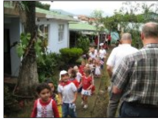
Children's Parade on Independence Day