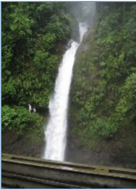
One of four waterfalls at Lapaz Waterfalls Garden

I thought you might like to see a few of the pictures of Costa Rica. It is a beautiful country. I'm so thankful to have had the opportunity to come study Spanish in such a beautiful place.