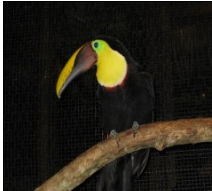
Toucan at Lapaz Waterfalls Garden