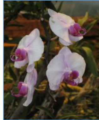
Wild Phaladopsis Orchids