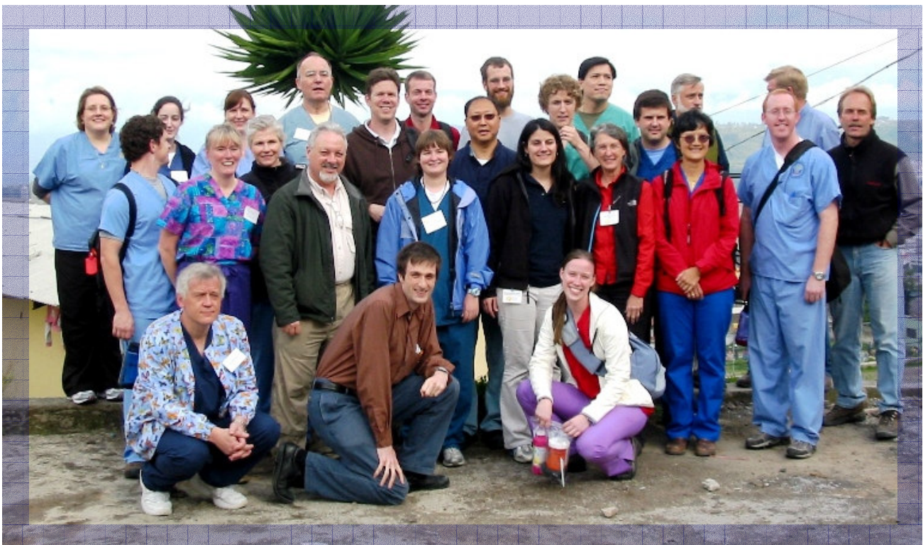
AMLT 2007 Faculty and Participants: Prepared to Serve Around the World in Christ's Name

“If you want to literally learn how to take the reigns on a project, you’re not going to find a more in-depth program.”